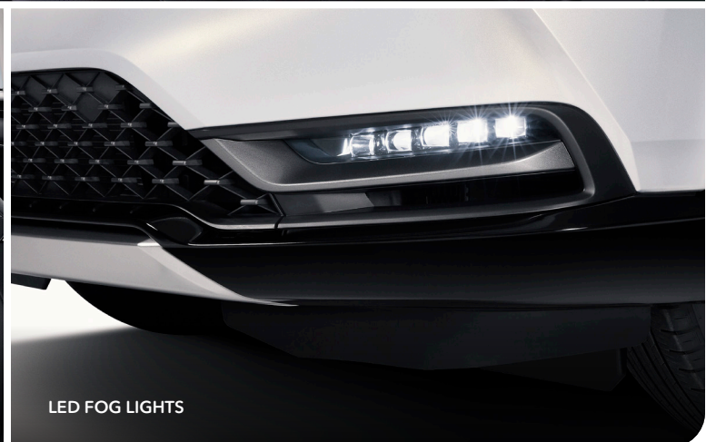
LED FOG LIGHTS