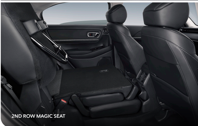
2ND ROW MAGIC SEAT